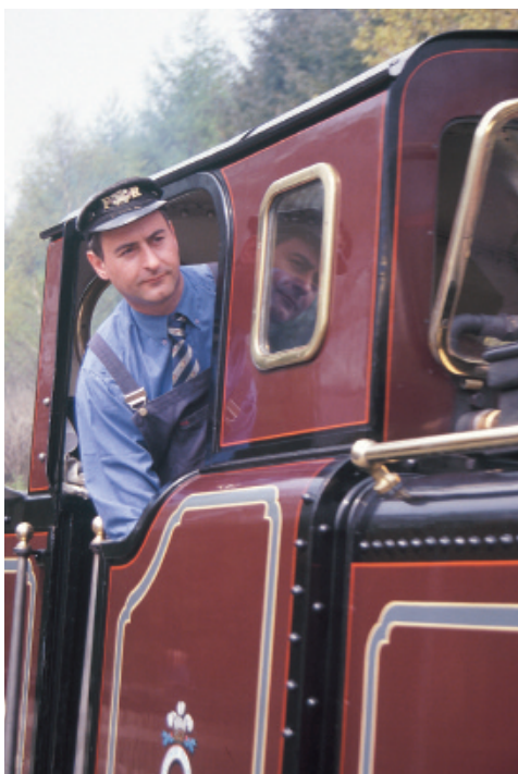
While the FR has paid staff, volunteers are the lifeblood of the railway.