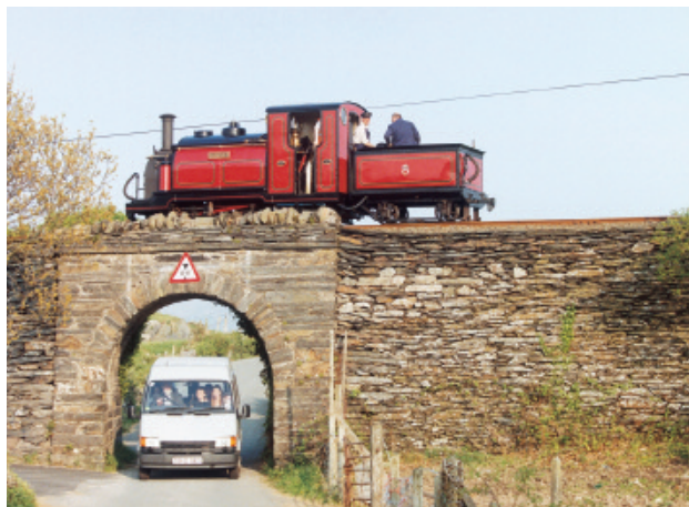
Awaiting his turn on Gwyndy Bank on 2 May 1999 is Prince, as a van demonstrates that the loading gauge for bridges over lanes is as confined as that for locos working on the FR.