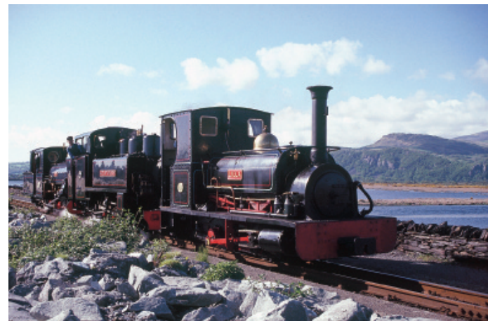
The black-liveried trio of Lilla, Mountaineer and Linda make a fine sight as they reach the Boston Lodge end of the Cob in company on 5 May 2003.