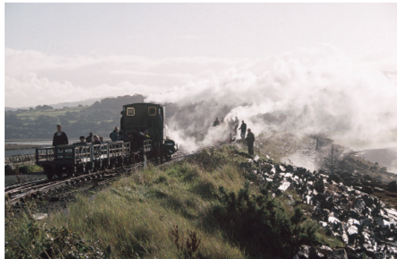
The morning of 8 October 2000 was magical as locomotives crossed the Cob from Boston Lodge to Harbour station.